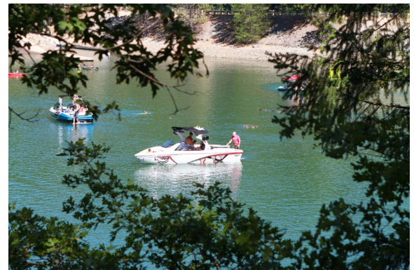
Boaters enjoy a day at Rollins Reservoir.