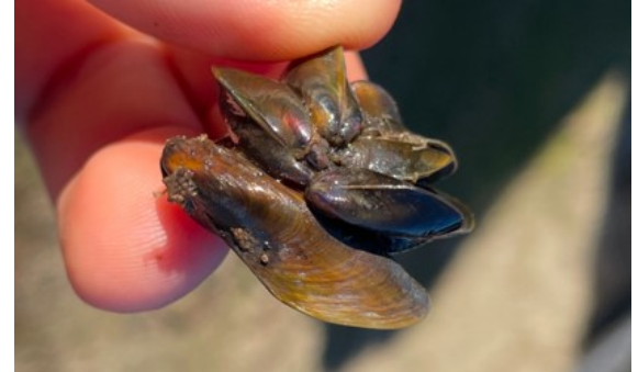
Golden mussels are invasive and post a threat to NID infrastructure if they get into District waterways.

Yes! Watercrafts that have ballasts, bilges or have live wells will need to quarantine for 60-days or be decontaminated prior to launching. It is hard to fully dry these types of watercrafts, the mussel larvae can live in less than an inch of water for longer than 45 days.