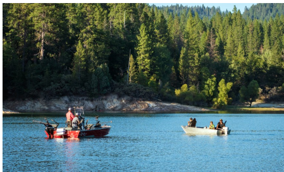
Fishing is a good time at Scotts Flat Reservoir.

NID approved decontamination stations are located at Greenhorn Campground- Rollins Lake (dip tank), Lake Tahoe (4 stations) and Lake Berryessa (4 stations).