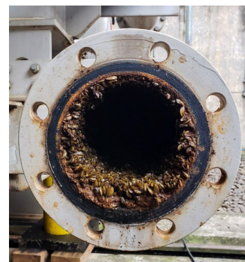
Golden mussels can quickly clog infrastructure, causing costly damage (photo from Brazil).