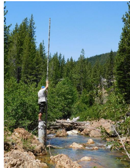
English Meadow site visit June 2020

NID's Environmental Resources staff and Leslie Mink (Plumas Corp.) visited English Meadow in June 2020. Site conditions were evaluated to refine the full application submitted to the Wildlife Conservation Board requesting $1.2M for improving forest resilience, completing instream channel modifications (debris jam installation), and tributary repair. During this trip, monitoring equipment to track stream temperature during the summer season were installed. Notification regarding project selection will be received in September 2020, and if successful, project implementation will begin in the Fall of 2021. This is a three-year proposal.