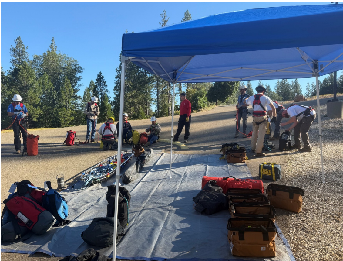
NID rescue team members fine-tuned their skills during a refresher course the week of June 22.