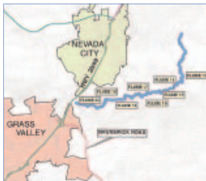
The planned D-S flume replacements are shown in this graphic.

late this summer with a decision anticipated later this year. A two-year construction period could begin next year, with completion expected in 2009.